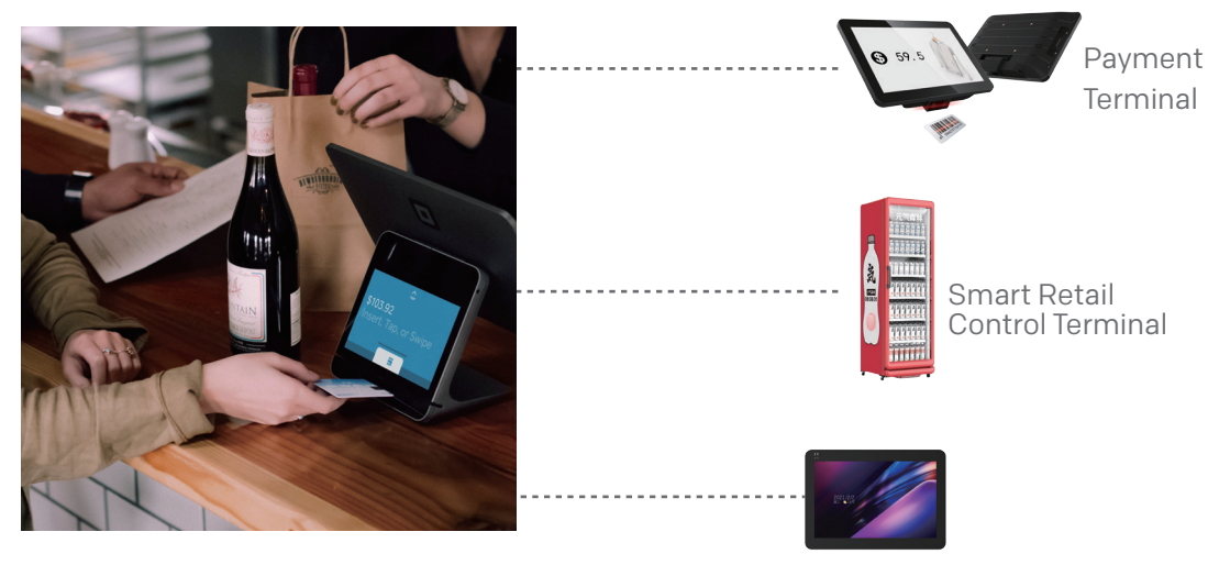
Payment Display Control Terminal